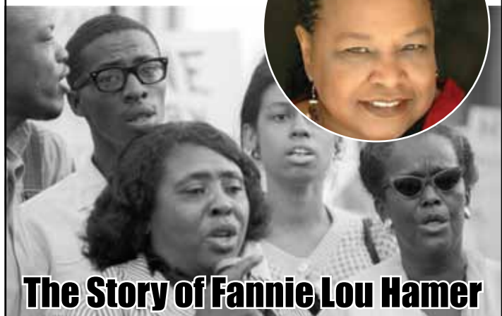
The Story of Fannie Lou Hamer