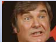
JAMES BEST-88 ACTOR (The Dukes of Hazzard) Pneumonia