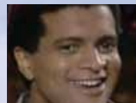
BEN POWERS-64 ACTOR (Good Times)