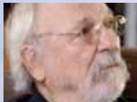
BILL ARHOS-80 AUSTIN CITY LIMITS FOUNDER Heart Disease