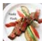
Foodie and Friend Featured Article: FOODIE FINDS