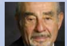
JOEL SPIRA-88 INVENTOR (Light Dimmer) Heart Attack