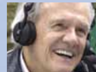
HOT ROD HUNDLEY-80 NBA PLAYER/BROADCASTER (Lakers) Alzheimer's Disease