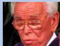
ROBERT H. SCHULLER-88 TELEVANGELIST (Hour of Power)