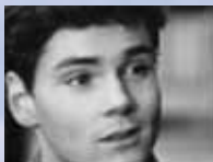
JONATHAN CROMBIE-48 ACTOR