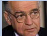
RICHARD DYSART-86 ACTOR (L.A. Law)