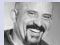
TOM TOWLES-65 ACTOR (NYPD Blue)