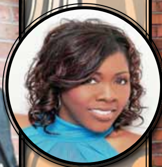
Special Guests LACEY