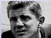
CHUCK BEDNARIK-89 NFL PLAYER (Philadelphia Eagles)