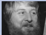
GARY DAHL-78 PET ROCK INVENTOR COPD