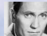
GREGORY WALCOTT-87 ACTOR