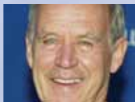
GEOFFREY LEWIS-79 ACTOR (High Plains Drifter)