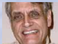
HERB TRIMPE-75 ARTIST (Hulk; Thor) CO-CREATOR OF WOLVERINE