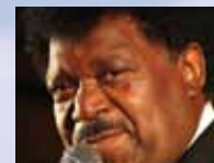
PERCY SLEDGE-74 R&B SINGER Liver Cancer