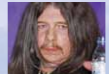
BOB BURNS-64 DRUMMER (Lynyrd Skynyrd) Traffic Collision