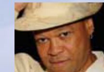
JOHNNY KEMP-55 SINGER (Just Got Paid) Fall