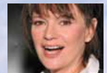
ALBERTA WATSON-60 ACTRESS (La Femme Nikita; 24) Cancer